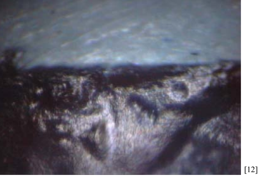
Illustration 4 - Images of printing (x276 magnification) of sections of the letterheads of the Bracken Letters [3], [4] and [5] and the Letter from File 800/86 [12]